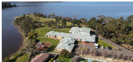
The Hobart Campus was established in 1994 and has grown from its small beginnings in a converted two-storey house to our current premises set on the water's edge in Windermere Bay.

OneSchool Global TAS is a member of a world-wide group of schools, namely OneSchool Global, one of the world's largest and most comprehensive, truly global schools. Together we develop learners who "learn how to learn" through a forward looking and pioneering approach to education. While academic excellence has and always will be a priority, OneSchool challenges dated educational practices and processes with our Self-Directed Learning program. We place the focus on what and how students are learning, rather than merely on what is being taught.