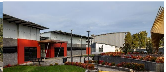
The original Launceston Campus commenced in 1995 with only secondary school students and expanded in 2007 to provide for students from Years 3 through to 12. In 2019, we opened the doors of our new Campus situated in Kings Meadows – a former call centre completely transformed into a vibrant and modern, state-of-the-art learning environment.

Enrolment at OneSchool Global TAS is open to the children of all Plymouth Brethren families and children of families who are willing and able to support the ethos of the School. The school has a rich academic program which is supported by an extensive ICT blended mode of teaching and learning, but also offers a vibrant Co-curricular program which includes sport, music and community involvement.