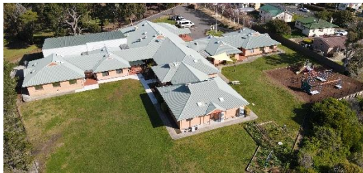
The Hobart Campus was established in 1994 and has grown from its small beginnings in a converted two-storey house to our current premises set on the water's edge in Windermere Bay.

OneSchool Global TAS is a member of a world-wide group of schools, namely OneSchool Global, one of the world's largest and most comprehensive, truly global schools. Together we develop learners who “learn how to learn” through a forward looking and pioneering approach to education. While academic excellence has and always will be a priority, OneSchool challenges dated educational practices and processes with our Self-Directed Learning program. We place the focus on what and how students are learning, rather than merely on what is being taught.