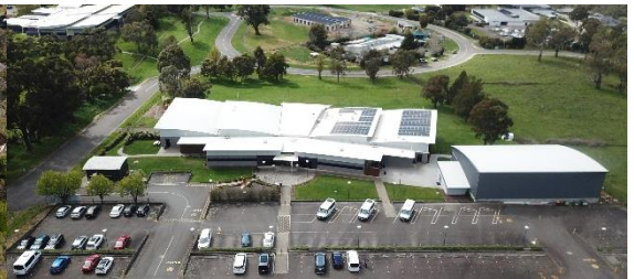
The original Launceston Campus commenced in 1995 with only secondary school students and expanded in 2007 to provide for students from Years 3 through to 12. In 2019, we opened the doors of our new Campus situated in Kings Meadows – a former call centre completely transformed into a vibrant and modern, state-of-the-art learning environment.