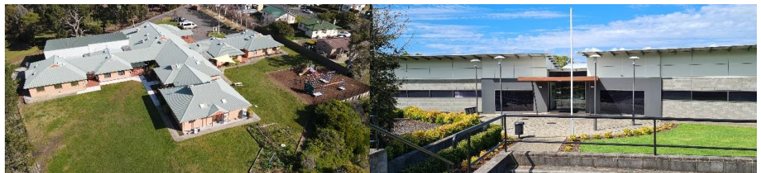
The Hobart Campus was established in 1994 and has grown from its small beginnings in a converted two-storey house to our current premises set on the water's edge in Windermere Bay.

OneSchool Global TAS is a member of a world-wide group of schools, namely OneSchool Global, one of the world's largest and most comprehensive, truly global schools. Together we develop learners who "learn how to learn" through a forward looking and pioneering approach to education. While academic excellence has and always will be a priority, OneSchool challenges dated educational practices and processes with our Self-Directed Learning program. We place the focus on what and how students are learning, rather than merely on what is being taught.