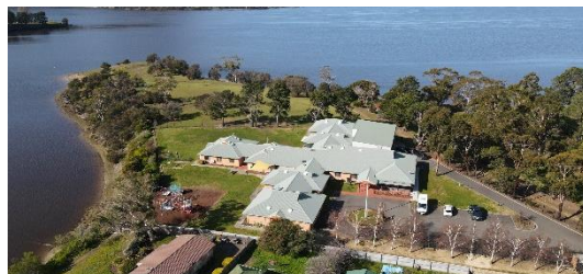
The Hobart Campus was established in 1994 and has grown from its small beginnings in a converted two-storey house to our current premises set on the water's edge in Windermere Bay.

OneSchool Global TAS is a member of a world-wide group of schools, namely OneSchool Global, one of the world's largest and most comprehensive, truly global schools. Together we develop learners who "learn how to learn" through a forward looking and pioneering approach to education. While academic excellence has and always will be a priority, OneSchool challenges dated educational practices and processes with our Self-Directed Learning program. We place the focus on what and how students are learning, rather than merely on what is being taught.