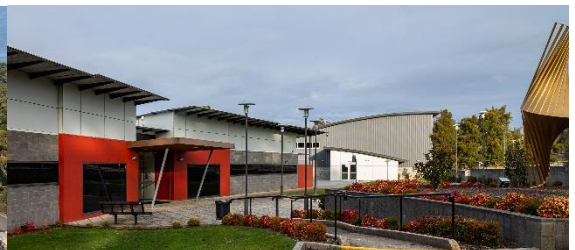
The original Launceston Campus commenced in 1995 with only secondary school students and expanded in 2007 to provide for students from Years 3 through to 12. In 2019, we opened the doors of our new Campus situated in Kings Meadows – a former call centre completely transformed into a vibrant and modern, state-of-the-art learning environment.

Enrolment at OneSchool Global TAS is open to the children of all Plymouth Brethren families and children of families who are willing and able to support the ethos of the School. The school has a rich academic program which is supported by an extensive ICT blended mode of teaching and learning, but also offers a vibrant Co-curricular program which includes sport, music and community involvement.