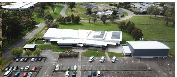
The original Launceston Campus commenced in 1995 with only secondary school students and expanded in 2007 to provide for students from Years 3 through to 12. In 2019, we opened the doors of our new Campus situated in Kings Meadows – a former call centre completely transformed into a vibrant and modern, state-of-the-art learning environment.

Enrolment at OneSchool Global TAS is open to the children of all Plymouth Brethren families and children of families who are willing and able to support the ethos of the school. The school has a rich academic program which is supported by an extensive ICT blended mode of teaching and learning, but also offers a vibrant co-curricular program which includes sport, music and community involvement.