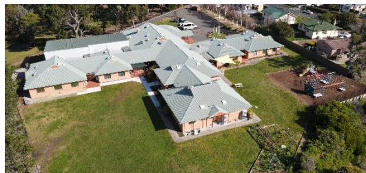
The Hobart Campus was established in 1994 and has grown from its small beginnings in a converted two-storey house to our current premises set on the water's edge in Windermere Bay.

OneSchool Global TAS is a member of a world-wide group of schools, namely OneSchool Global, one of the world's largest and most comprehensive, truly global schools. Together we develop learners who "learn how to learn" through a forward looking and pioneering approach to education. While academic excellence has and always will be a priority, OneSchool challenges dated educational practices and processes with our Self-Directed Learning program. We place the focus on what and how students are learning, rather than merely on what is being taught.